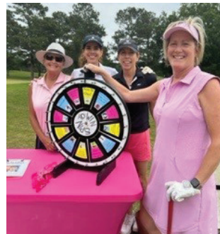
Ladies Team PFTC

Piney Point Golf Club played host to over eighty-four golfers on Thursday, May 18 as our annual Play Fore the Cure Golf Tournament took to the course, raising funds for our free mammogram program. From the picture-perfect weather to the "air cannon off the tee" game, it was a day filled with fun, fellowship, and philanthropy. The Foundation is grateful to each of the players and sponsors who make this tournament a success and we are thankful to be able to continue to offer this crucial program in our community. Early detection truly saves lives!