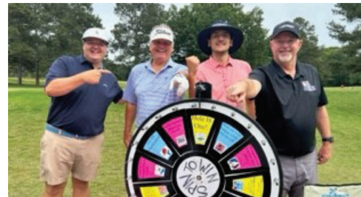
Uwharrie Team representatives