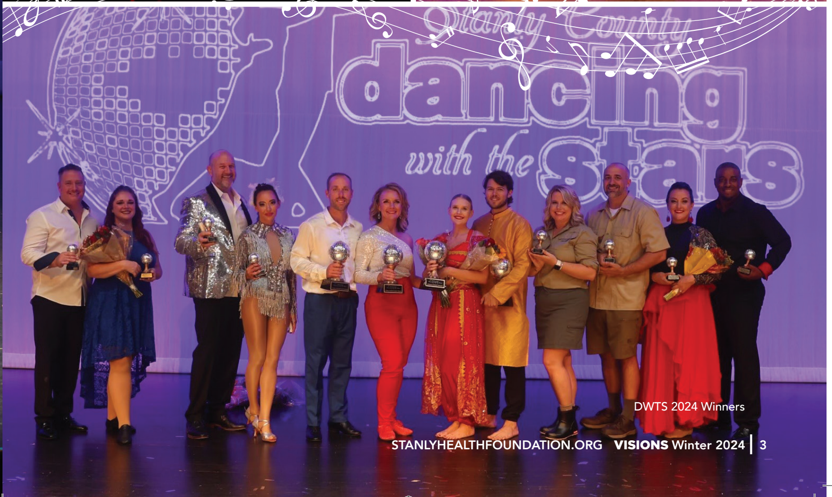
DWTS 2024 Winners