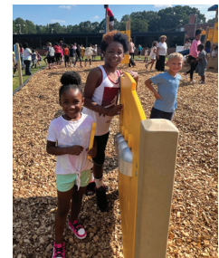
Children enjoy testing out the new playground equipment at the EE Waddell Center.

The ribbon-cutting for the new playground was held in September and the new equipment is now being enjoyed by children, families, and programs using the Waddell Center. Children are reaping the benefits of outdoor physical activity while enjoying an opportunity to learn key social skills such as sharing. Parents and grandparents also have the opportunity to socialize, bond and create social networks while watching their kids.