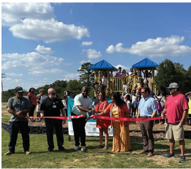
Representatives from Stanly Health Foundation, Atrium Health Stanly, the City of Albemarle, and Albemarle Parks and Recreation cut the ribbon on a new playground at the EE Waddell Center.

Recently, the Atrium Health Stanly Diversity, Equity and Inclusion teammate council requested a grant from the Foundation to build a playground in an underserved/financially needy neighborhood. The grant was approved, and AH Stanly, Stanly Health Foundation and Albemarle Parks and Recreation created a partnership to identify the area of greatest need. The EE Waddell Center was chosen and an environmentally friendly playground company was selected to do the installation of new equipment.