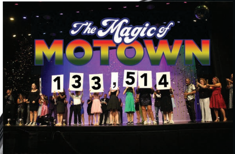
Dancers and audience celebrate the grand total.

Thank you to the community for continuing to support this important cause and for ensuring that the Butterfly House continues its crucial work for children and families in need.