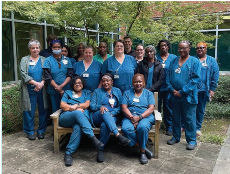
Members of the award-winning Atrium Health Stanly Environmental Services Team take a quick break from making the hospital five-star clean!