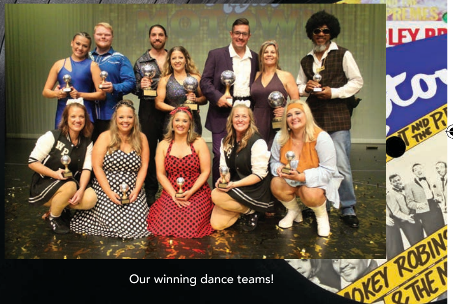
Our winning dance teams!