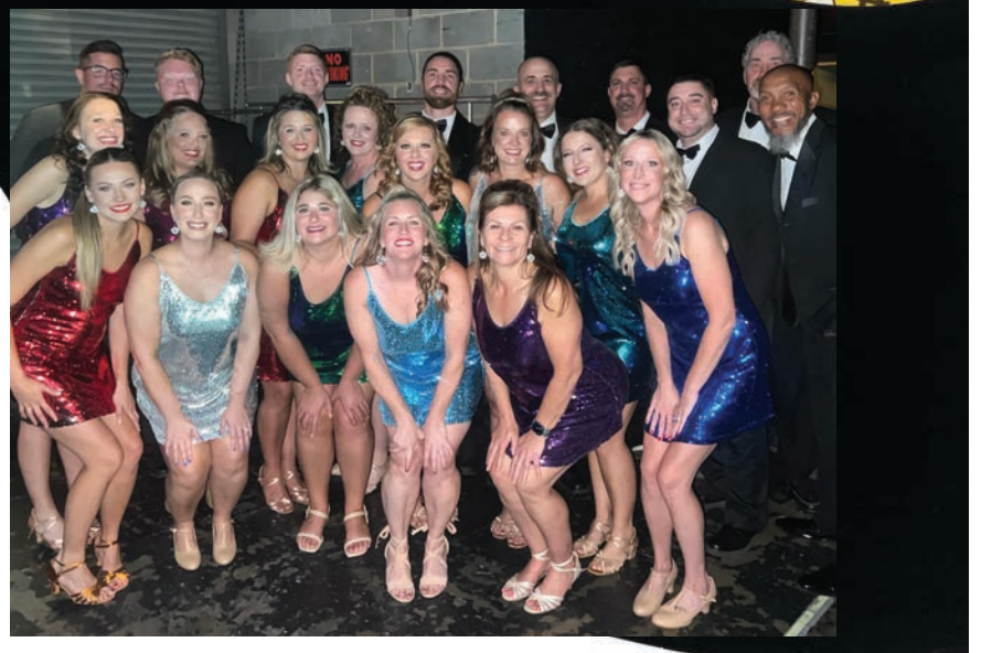
All dressed up and ready to take the stage for a great cause.